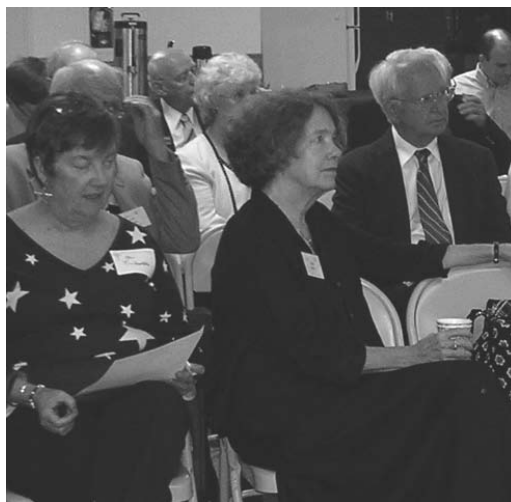
Participants listening to one of the interesting speakers at an NPC class at 9:15 a.m. on a recent Sunday morning.