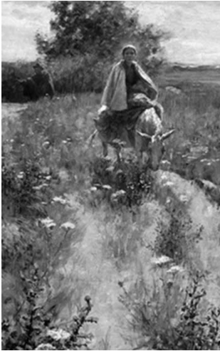
Flight into Egypt, George Hitchcock, 1892

The Art of NPC's Children Explores the Parables of the Lost and Found