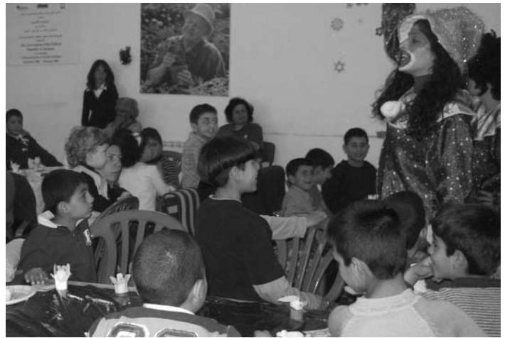
Children celebrating Easter in Bir Zeit

Vision's programs in Jerusalem, the West Bank, and Gaza. He then went to work as World Vision's executive director for international relations working with the Unit-