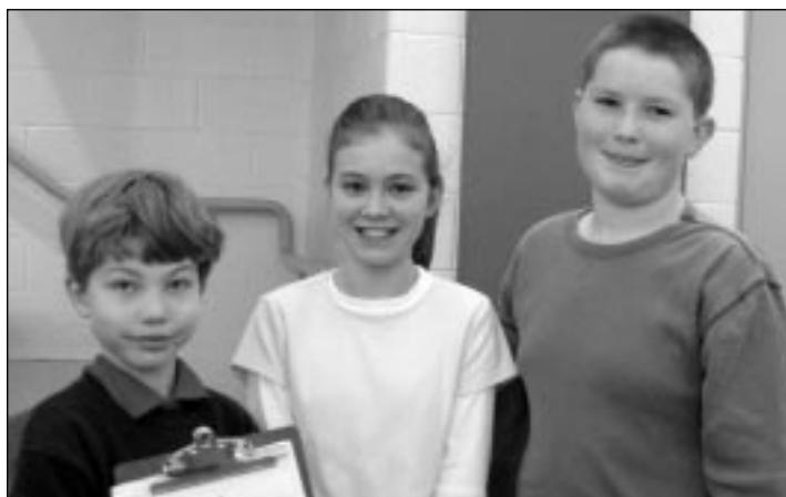
The Geography Bee's winning team

The final weeks at National Presbyterian School were filled with activity and celebration: